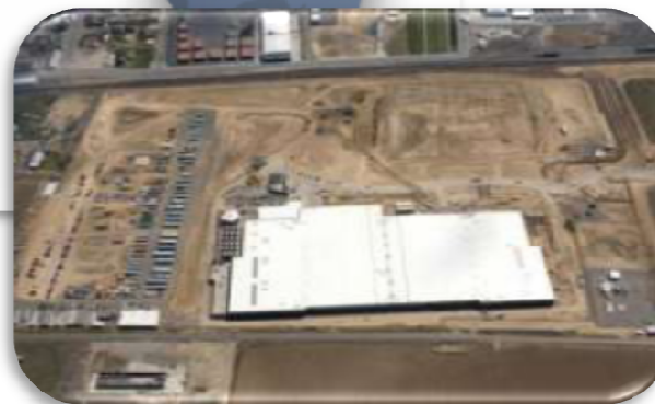
Data centre facilities of Windows Azure in Singapore. Picture taken at construction stage